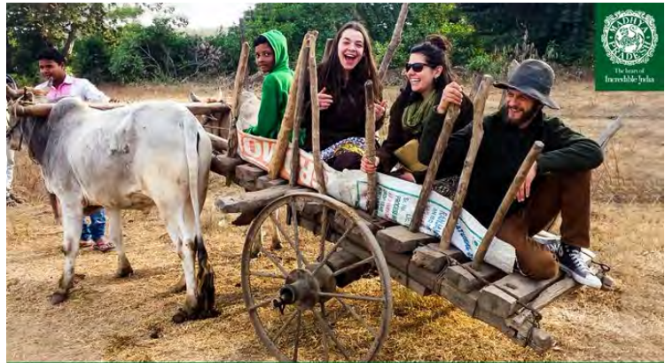
Experience the best of state's rural life with village walks

The temples of Khajuraho are India's unique gift to the world, representing love and joys of life in a sublime expression. Madhya Pradesh is also a shopper's paradise with beautiful Maheshwari and Chanderi textiles and bell metal craft of Bastar. The state is home to three UNESCO World Heritage Sites namely Sanchi, Bhimbetka and Khajuraho. But perhaps the best part about Madhya Pradesh is its accessibility. It is equally close to major tourist destinations from all over the country, being the 'Heart of India'.