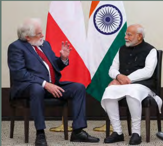
PM Narendra Modi met renowned Austrian physicist and Nobel Laureate Anton Zeilinger in Vienna.