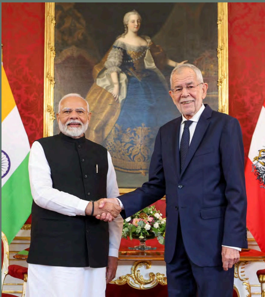
PM of India H.E. Mr. Narendra Modi met the president of Austria H.E. Mr. Alexander Van der Bellen.

Prime Minister Narendra Modi's visit to Austria was a historic occasion as it was the first visit by an Indian Prime minister to the country in 41 years. The visit also marked the 75th anniversary of diplomatic relations between India and Austria, underlining the long standing ties between the two nations.