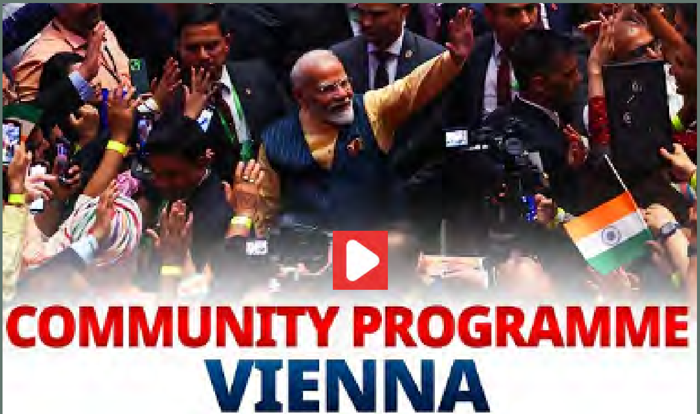
PM Narendra Modi addressed the India Diaspora in Vienna