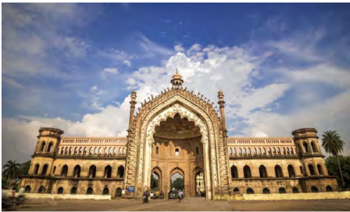
Rumi Darwaza, Lucknow