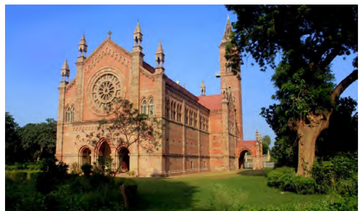
Kanpur Memorial Church, Kanpur

Uttar Pradesh is one of the states that aesthetically defines India and its rich history that's as ancient as the time known. This is the land wherein great sages have emerged, religions evolved and two great epic of India: Ramayana and Mahabharata have been inspired from. With each progressing century, the state has vouched for the secularity of India by giving home to various religions: Hindu, Jainism, Islamic, Buddhist and more.