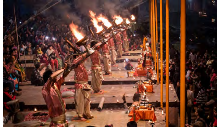
Ganga Ghats, Varanasi