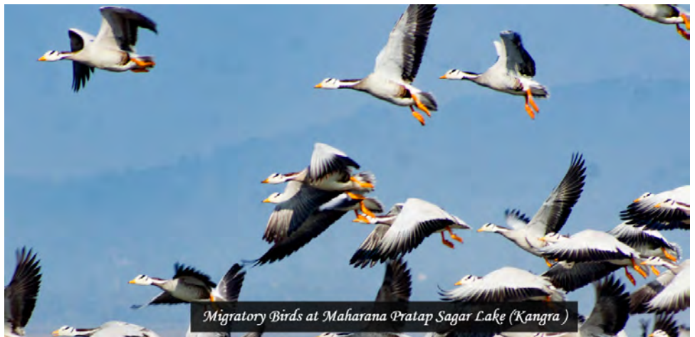
Migratory Birds at Maharana Pratap Sagar Lake (Kangra)