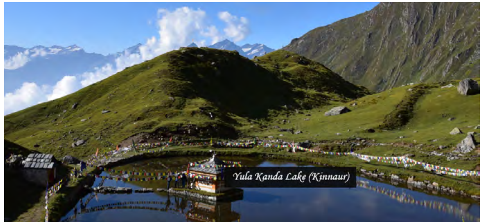
Yula Kanda Lake (Kinnaur)

Himachal situated in the heart of the western Himalaya, identified as "Dev Bhumi" and is believed to be the abode of Gods and Goddesses. The entire State is punctuated with stone as well as wood temples. The shadowy valleys, rugged crags, glaciers and gigantic pines and roaring rivers and exquisite flora and fauna compose the symphony that is for ever Himachal.