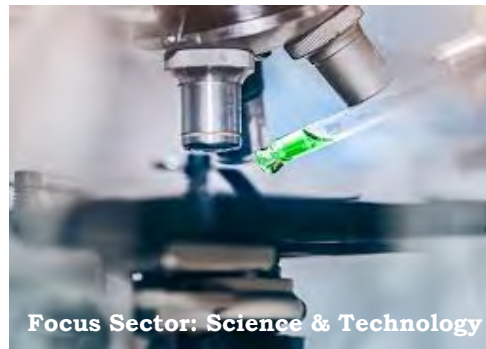
Focus Sector: Science & Technology