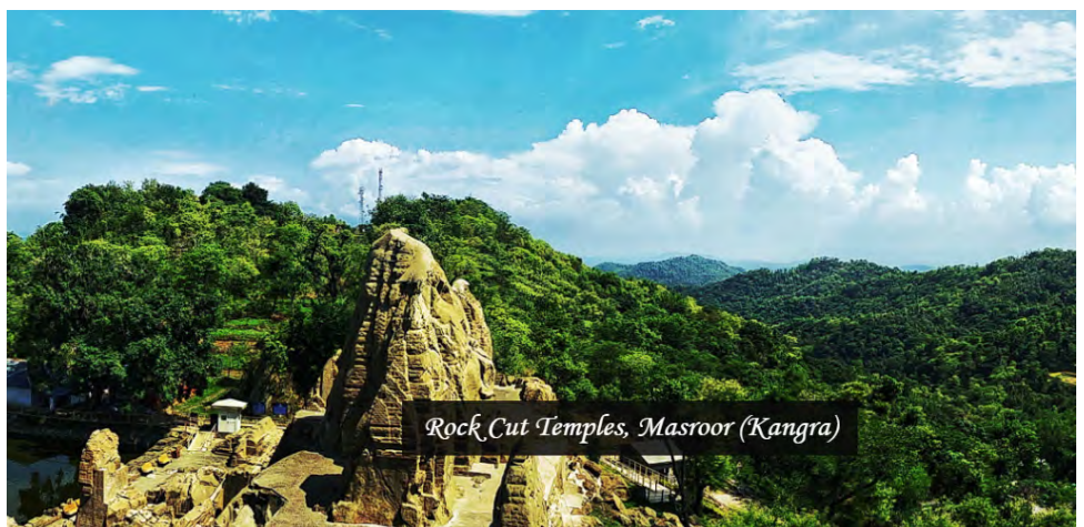
Rock Cut Temples, Masroor (Kangra)