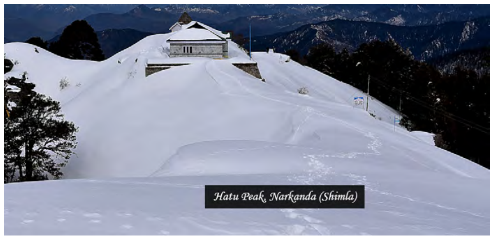
Hatu Peak, Narkanda (Shimla)